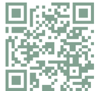
South Dakota CHW/CHR Site Map

To apply, scan the code or visit: www.chwsd.org/proposal-for-educational-booth/